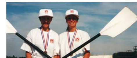
Your logo on training kit example

Regatta Sponsorship - held in August every year, this is our premiere event and is attended by over 2000 visitors from all over the country.