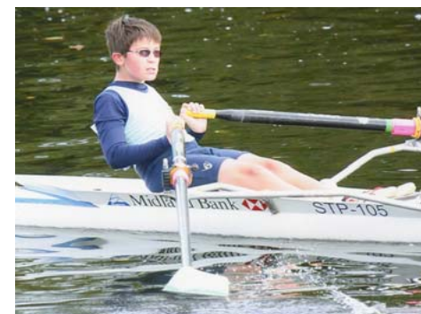
Boat sponsorship example